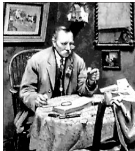
The Stamp Collector, by Charles Spencelay.

Whereas we in the first group of three had been almost taciturn and stingy with our responses, taking only a couple of sentences each, the