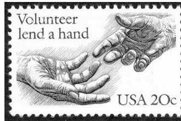
U.S. Scott No. 2039, Volunteerism Issue, 1983.